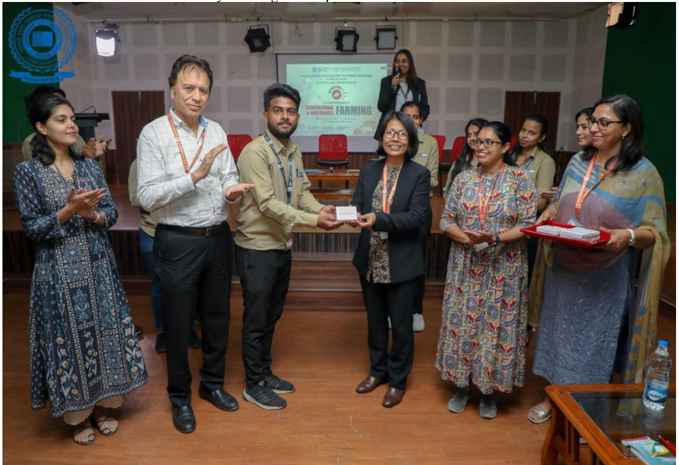
Felicitating students by the Dean and Hod of the department