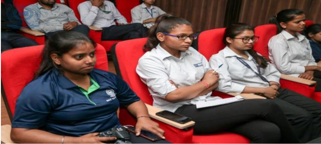
Students were actively listening to the speaker of the session